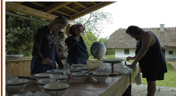
Ceramic Painting Workshop— Moravske Toplice, Slovenia