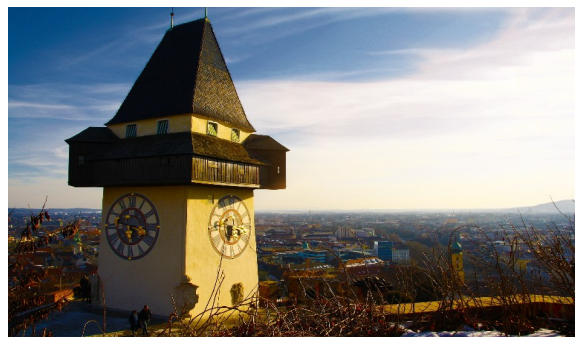
Clock Tower—Graz, Austria

Day 6 (Saturday) – Vac – Tata Accommodation