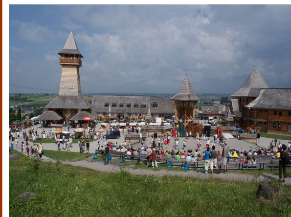
Vychodna Folklore Festival— Vychodna, Slovakia

Rest Day 4 – St. Petrus Vini – Spa Treatment & Farewell Dinner