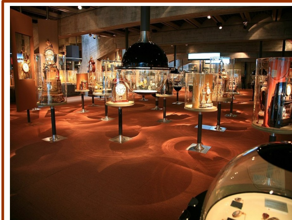
International Clock Museum—La Chaux-de-Fonds