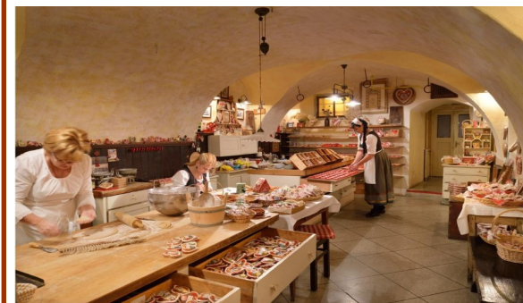
Gingerbread-making—Moravske Toplice, Slovenia

Rest Day 4 (Sunday) – Tihany – Spa Treatment & Farewell Dinner