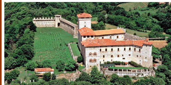
Castello Estense—Varese, Italy

Day 11 – Lugano – Bellagio, Italy Accommodation