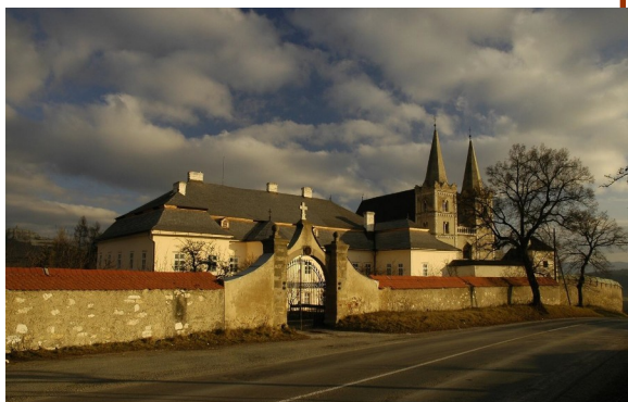
St. Martin's Church—Spišské Podhradie, Slovakia