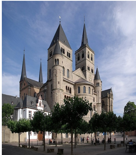
Trier Cathedral—Trier, Rhineland Palatinate