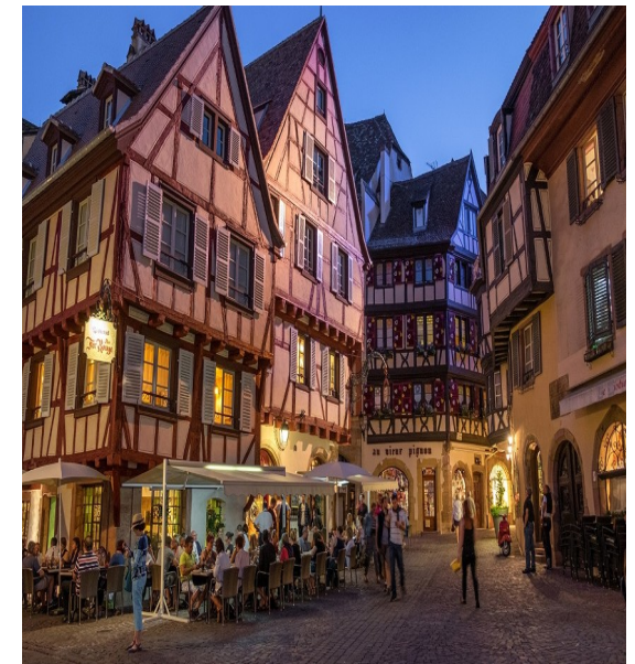
Colmar Historic Town—Alsace, France

Rest Day 4 – Wallerfangen – Spa Treatment & Farewell Dinner