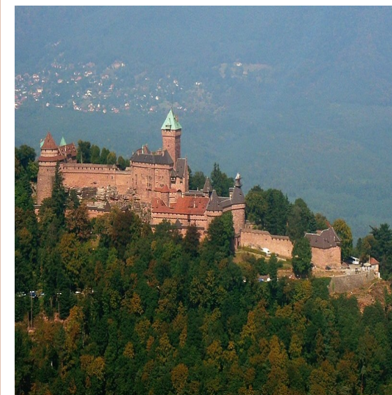
Chateau du Haut-Koenigsbourg —Orschwiller, Alsace, France

Day 11 – Calw – Gengenbach Accommodation