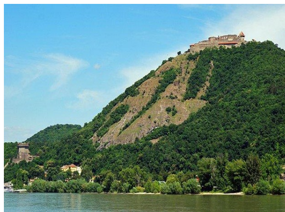
Visegrad Royal Palace—Visegrad, Hungary

Day 10 – Gumpoldskirchen – Vienna - Mayerling