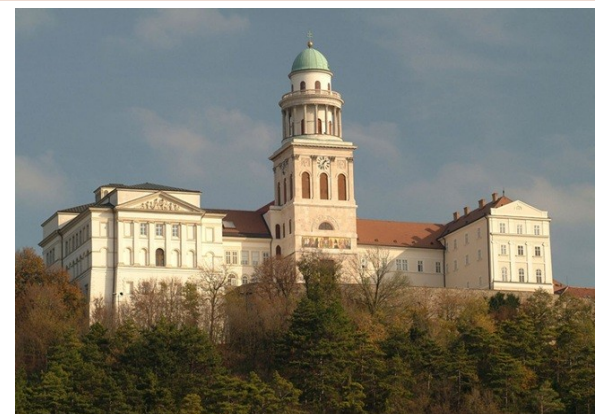
Pannonhalma Archabbey— Hungary