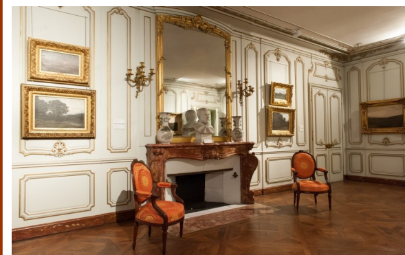
Museum Sarret de Grozon—Arbois, France

Rest Day 4 – Rolle – Spa Treatment & Farewell Dinner