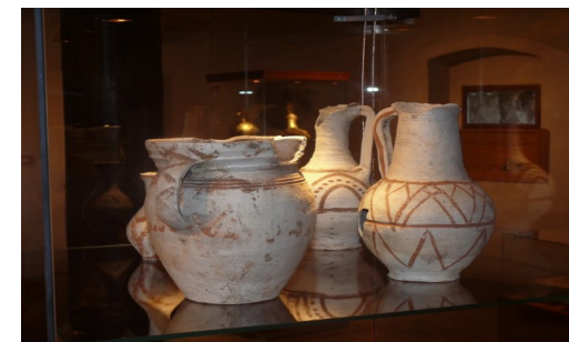
Filakova Castle Museum— Filakova, Slovakia

Day 12 – Gleisdorf – Körmend, Hungary Accommodation