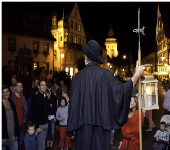
Night Watchman— Gengenbach, Black Forest Germany