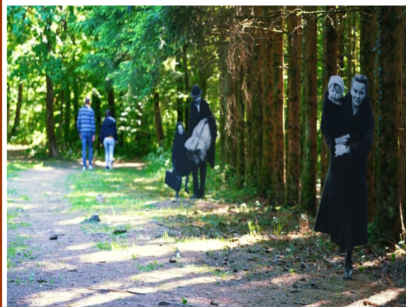
Schumannseck Remembrance Trail—Wiltz, Luxembourg

Day 10 – Ettlingen – Calw Accommodation – Eberdingen – Esslingen