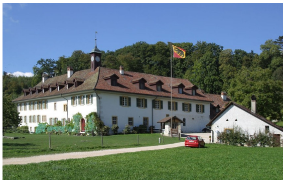
Former Monastery, St. Peter's Island—Twann Switzerland