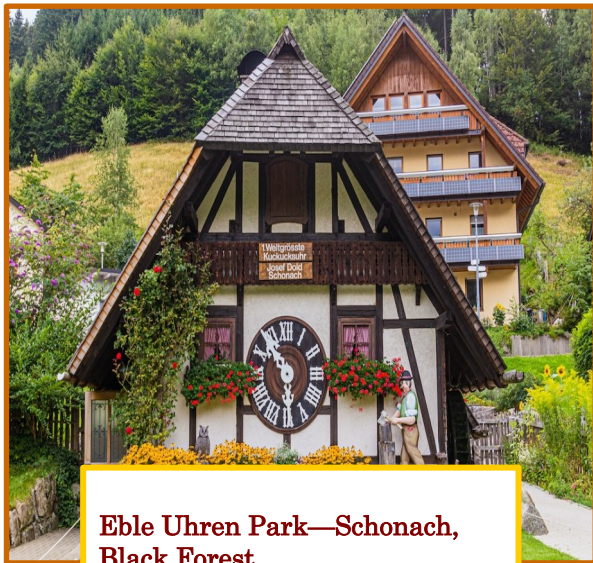
Eble Uhren Park—Schonach, Black Forest