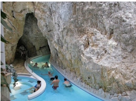
Miskolcápolca Cave Bath— Miskolc, Hungary