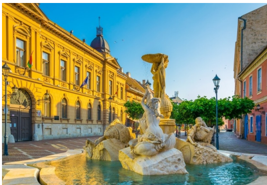
Széchenyi Square— Győr, Hungary