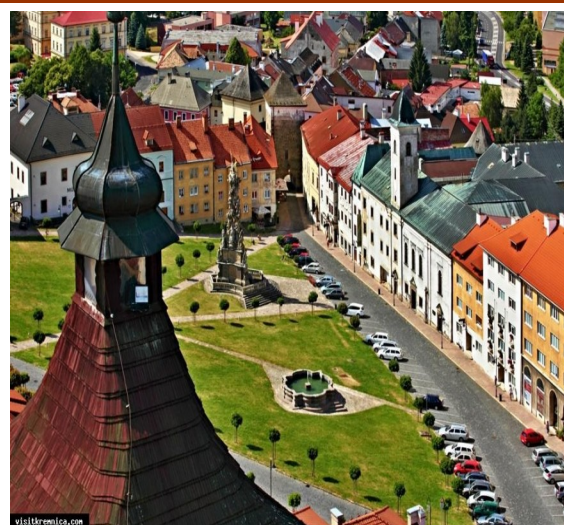
Burgher Houses—Kremnica, Slovakia