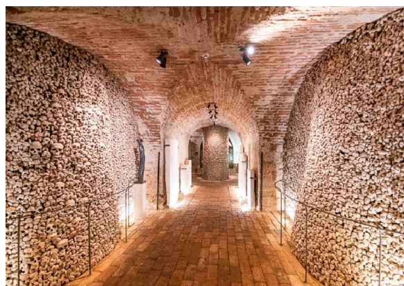
St. James' Church Ossuary— Brno, Czech Republic

Day 6 (Saturday) – Kyjov – Lednice, Czech Republic Accommodation